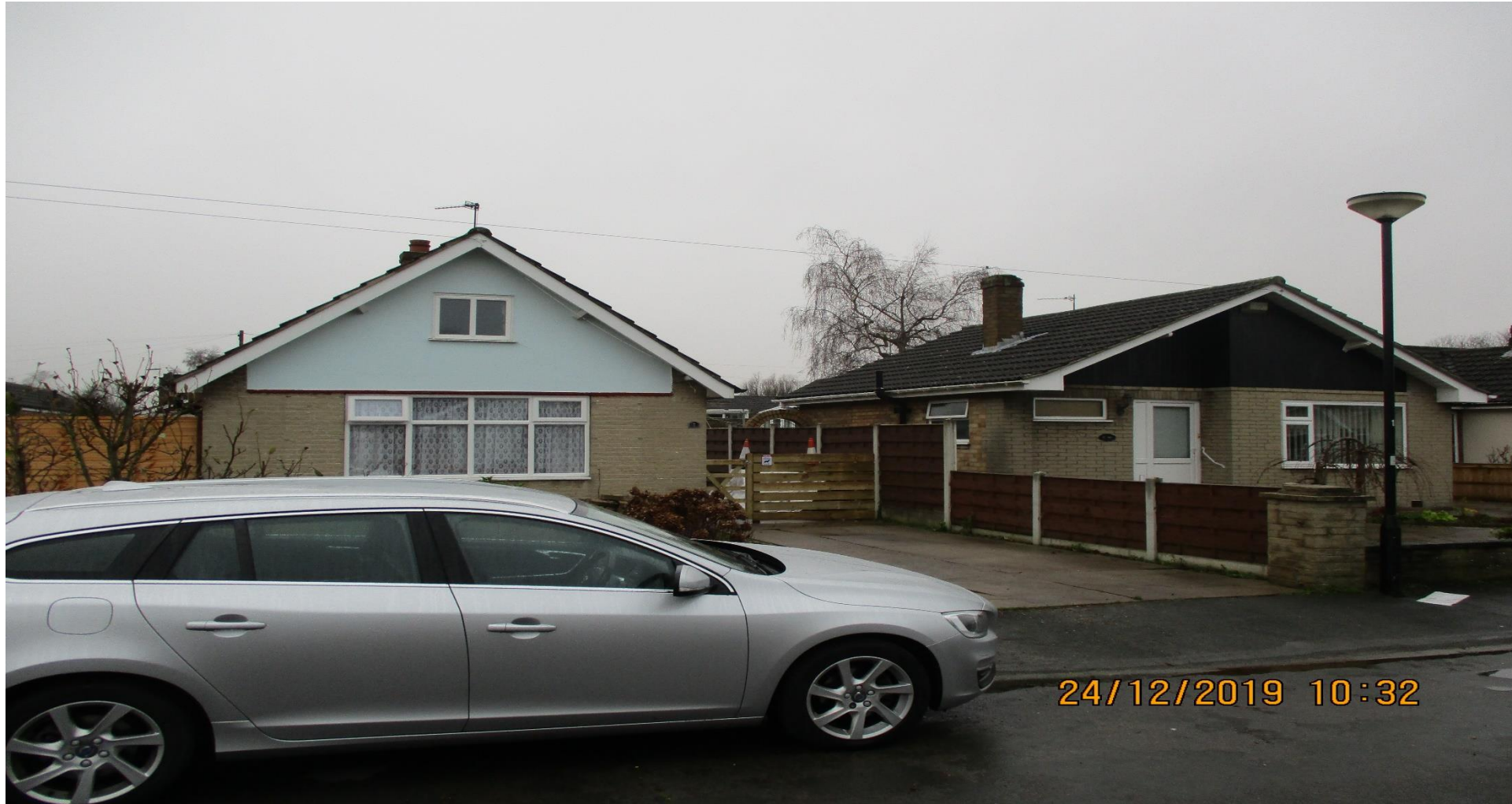
Application site to the left